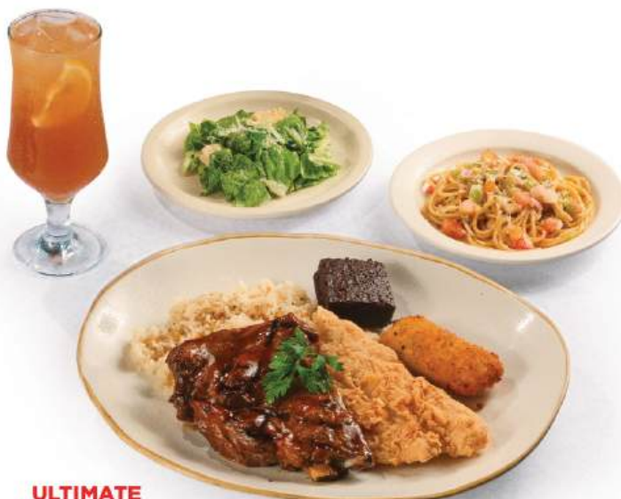
ULTIMATE PARTY PACKAGE

A plate of Scallops Scampi Pasta, Fridays Mozzarella, Fried Cobbler, BBQ Riblets with Rice & Brownie. Comes with Side Caesar Salad & refillable Iced Tea.