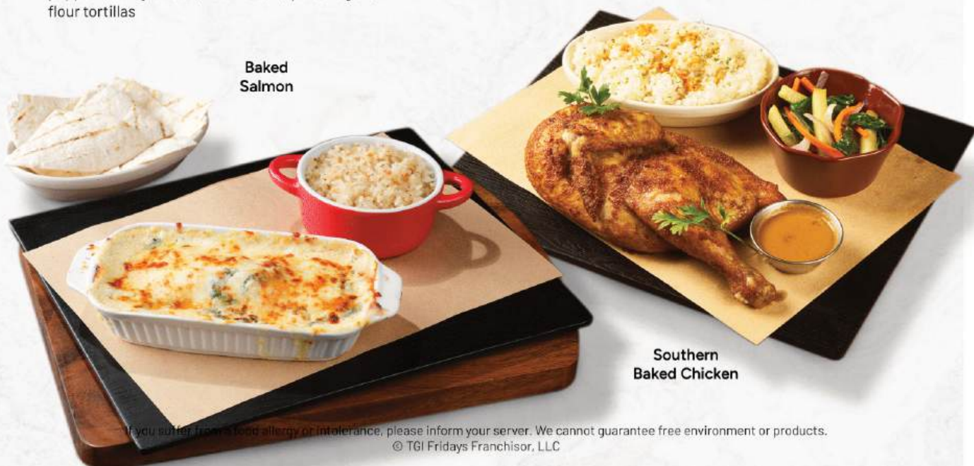
Southern Baked Chicken