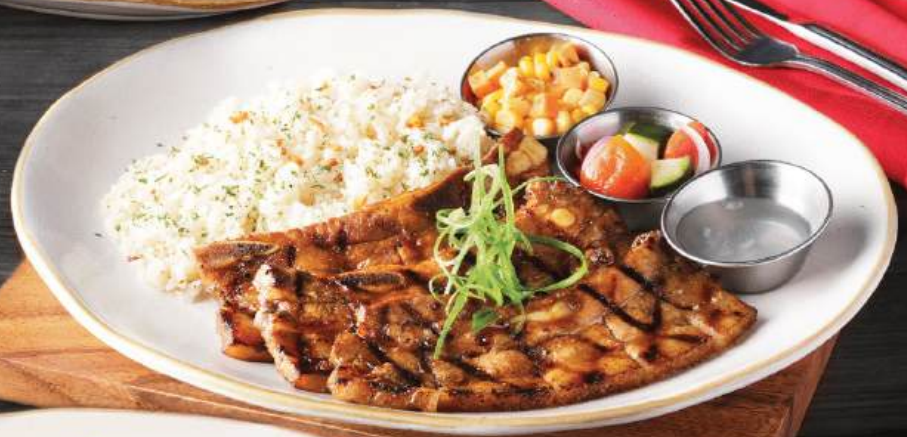
Filipino Pork Liempo