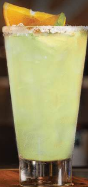
Margarita On the Rocks

Pomegranate Syrup, Fresh Sour, House Vodka, Blue Glitter and Lemon Lime Soda