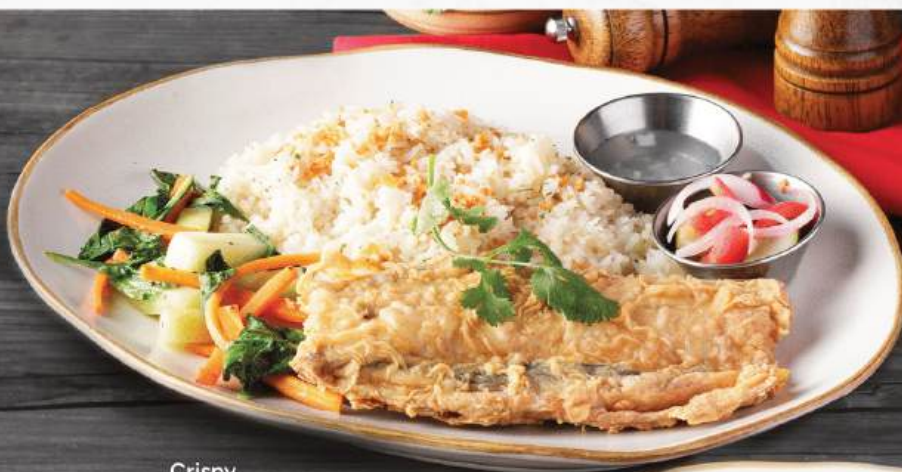
Crispy Smoked Fish