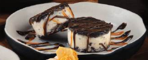
Ice Cream Cookie Madness