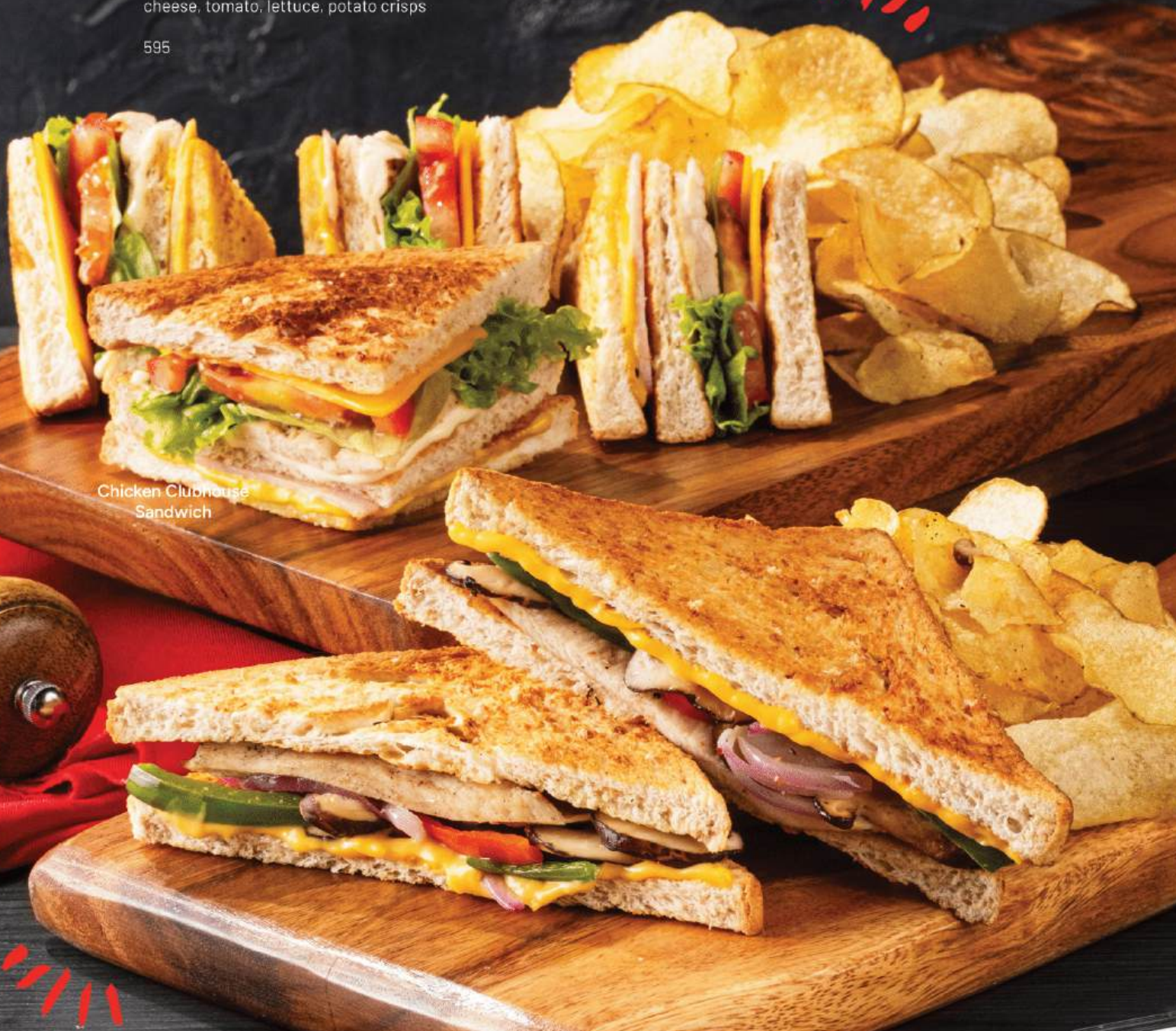
Chicken Clubhouse Sandwich