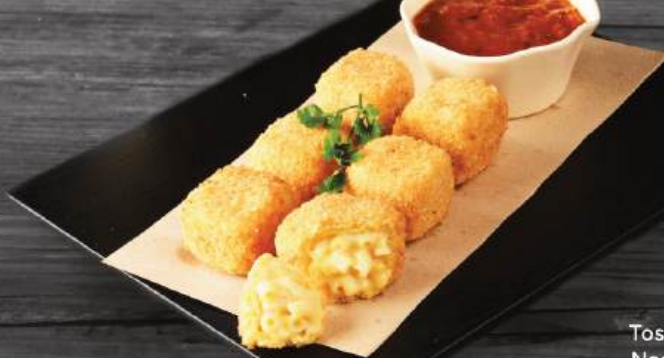
Mac & Cheese Bites