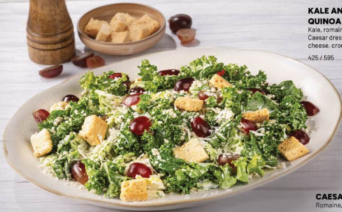
KALE AND QUINOA SALAD Kale, romaine, grapes, quinoa, Caesar dressing, parmesan cheese, croutons 425 / 595