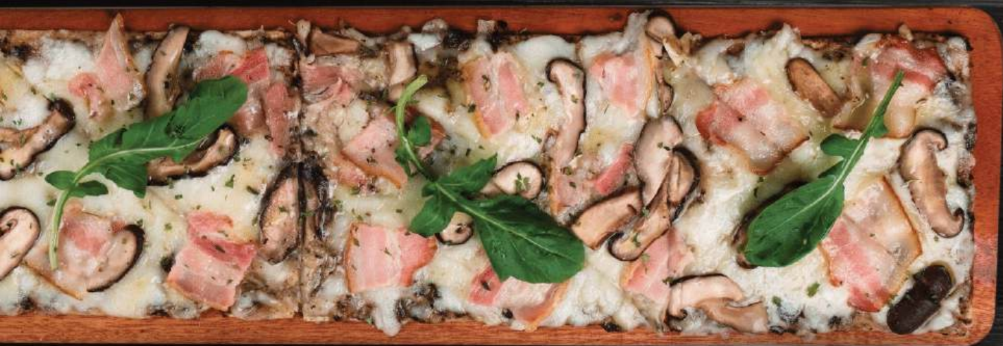
Truffle Bacon and Mushrooms