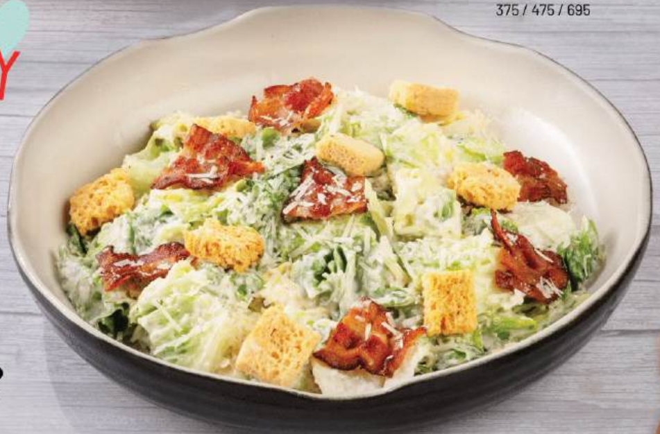
CAESAR SALAD Romaine, Caesar dressing, parmesan cheese, bacon, croutons 375 / 475 / 695