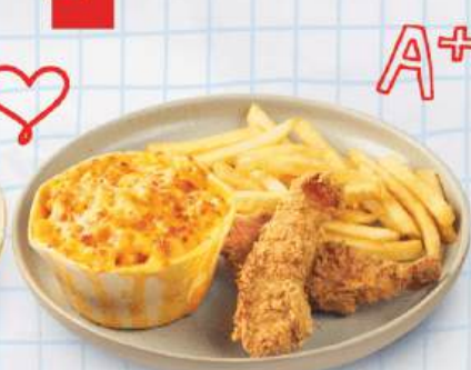
KIDS MEAL CHICKEN FINGERS WITH MAC AND CHEESE