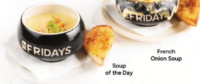
Soup of the Day