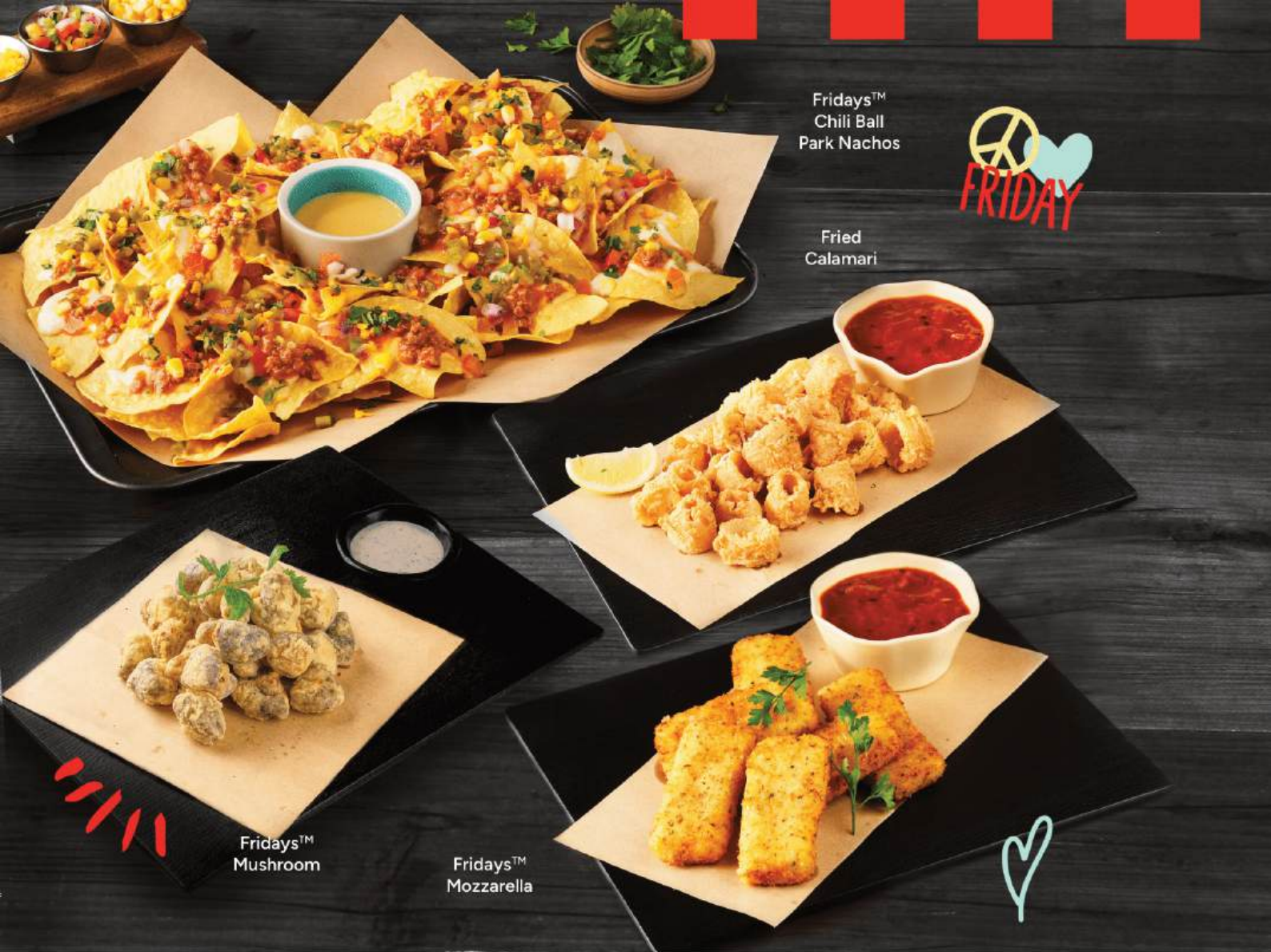
Fridays™ Chili Ball Park Nachos