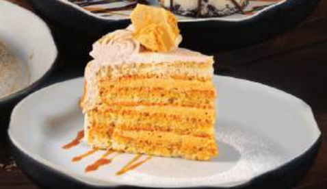
Salted Caramel Cake