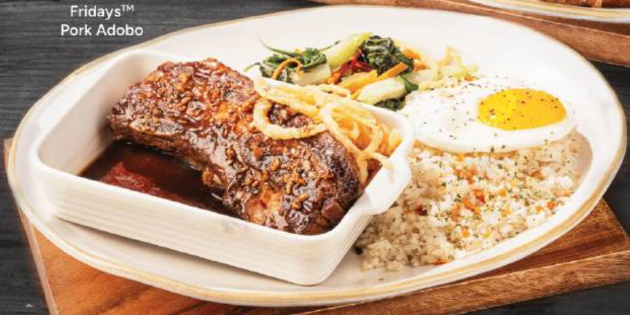
Fridays™ Pork Adobo