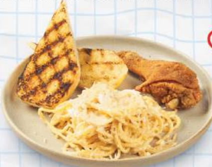
KIDS MEAL FRIED CHICKEN AND SPAGHETTI ALFREDO