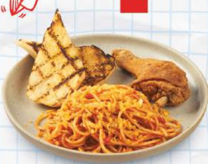
KIDS MEAL FRIED CHICKEN AND SPAGHETTI