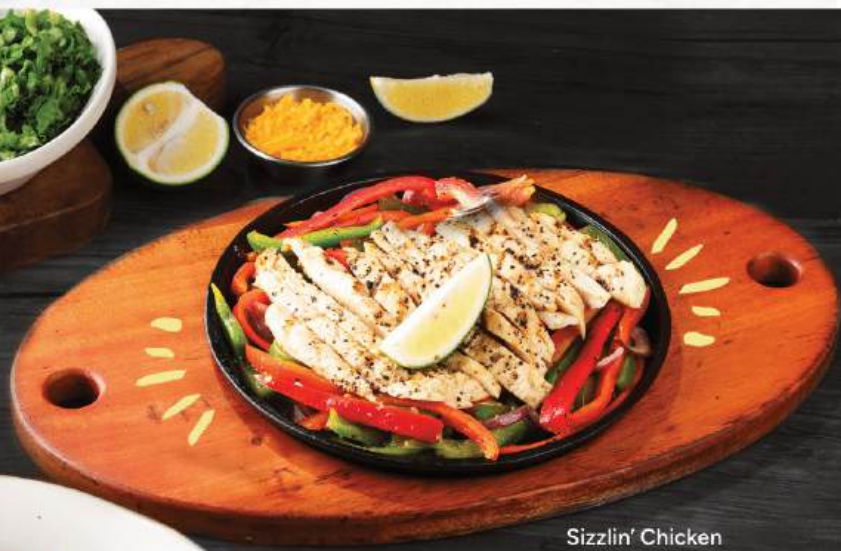
Sizzlin' Chicken Fajitas