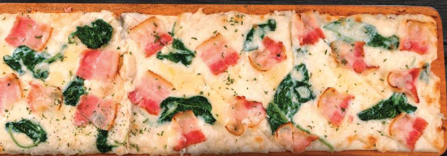
Bacon & Spinach