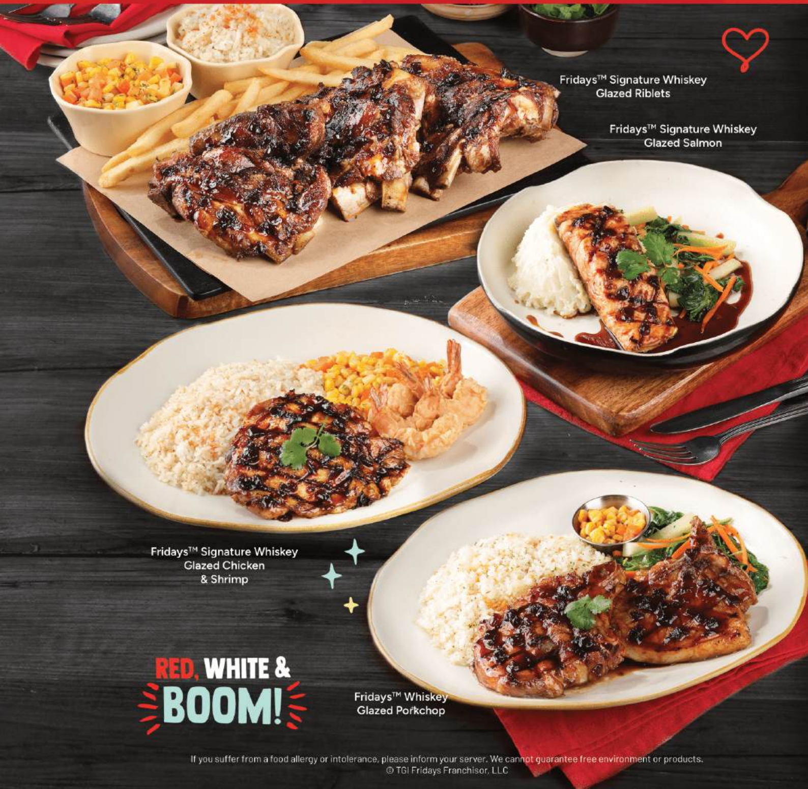
Fridays™ Signature Whiskey Glazed Riblets

FRIDAYS™ SIGNATURE WHISKEY GLAZED BABY BACK RIBS & SHRIMP 1045 Baby Back Ribs, original Fridays™ Whiskey Glaze, 4 pcs Cajun-spiced fried shrimp, crispy seasoned fries, corn