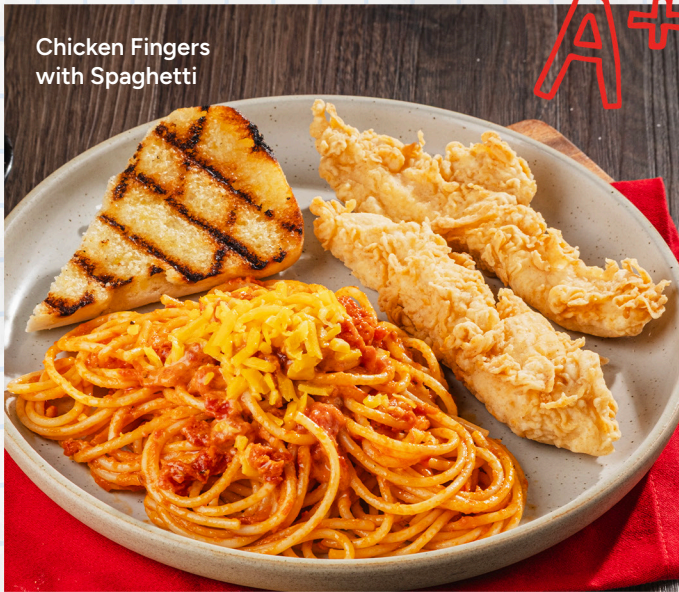
Chicken Fingers with Spaghetti