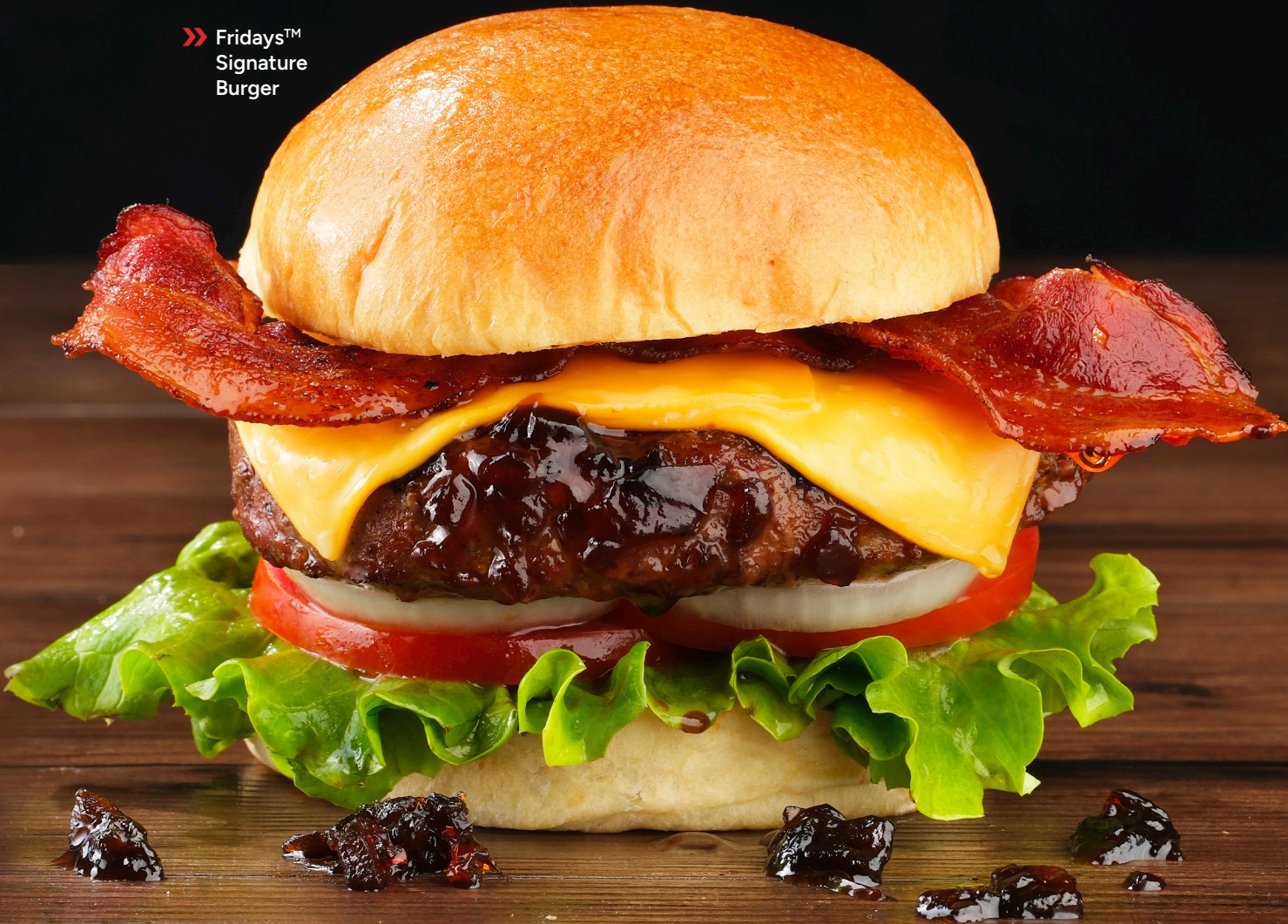
» Fridays™ Signature Burger