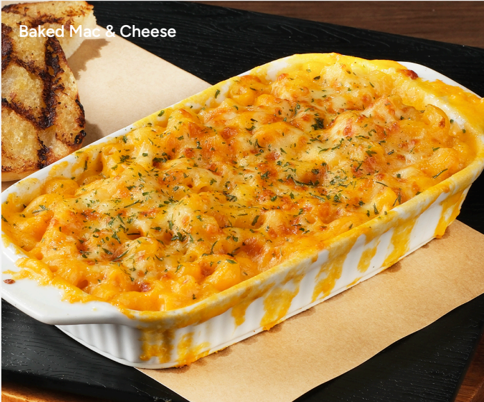
Baked Mac & Cheese