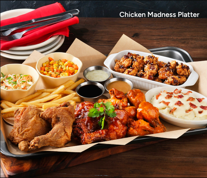
Chicken Madness Platter