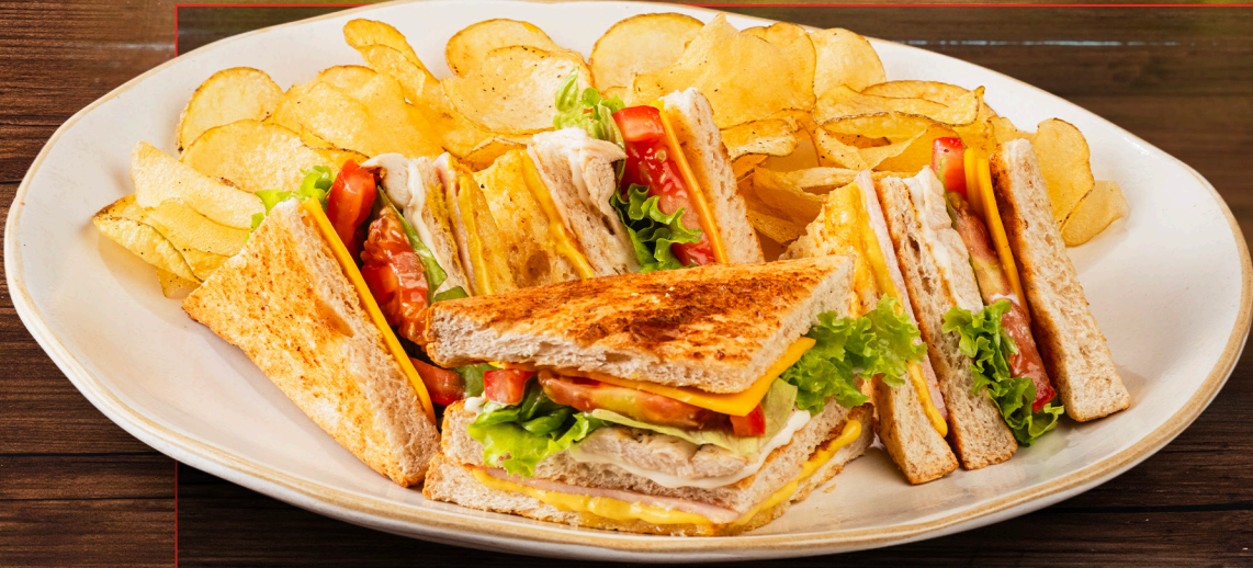
CHICKEN CLUBHOUSE SANDWICH Grilled chicken breast, ham, mayonnaise, honey mustard, american cheese, tomato, lettuce, whole wheat bread, potato crisps 595