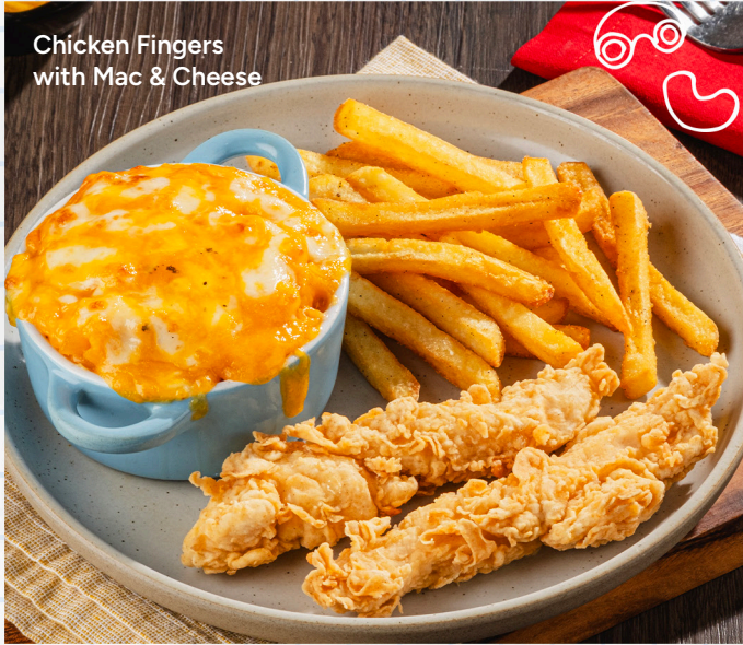
Chicken Fingers with Mac & Cheese