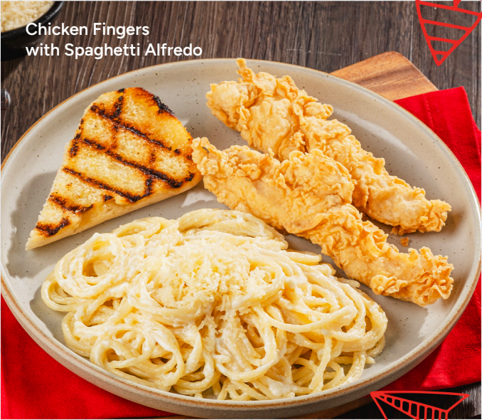
Chicken Fingers with Spaghetti Alfredo