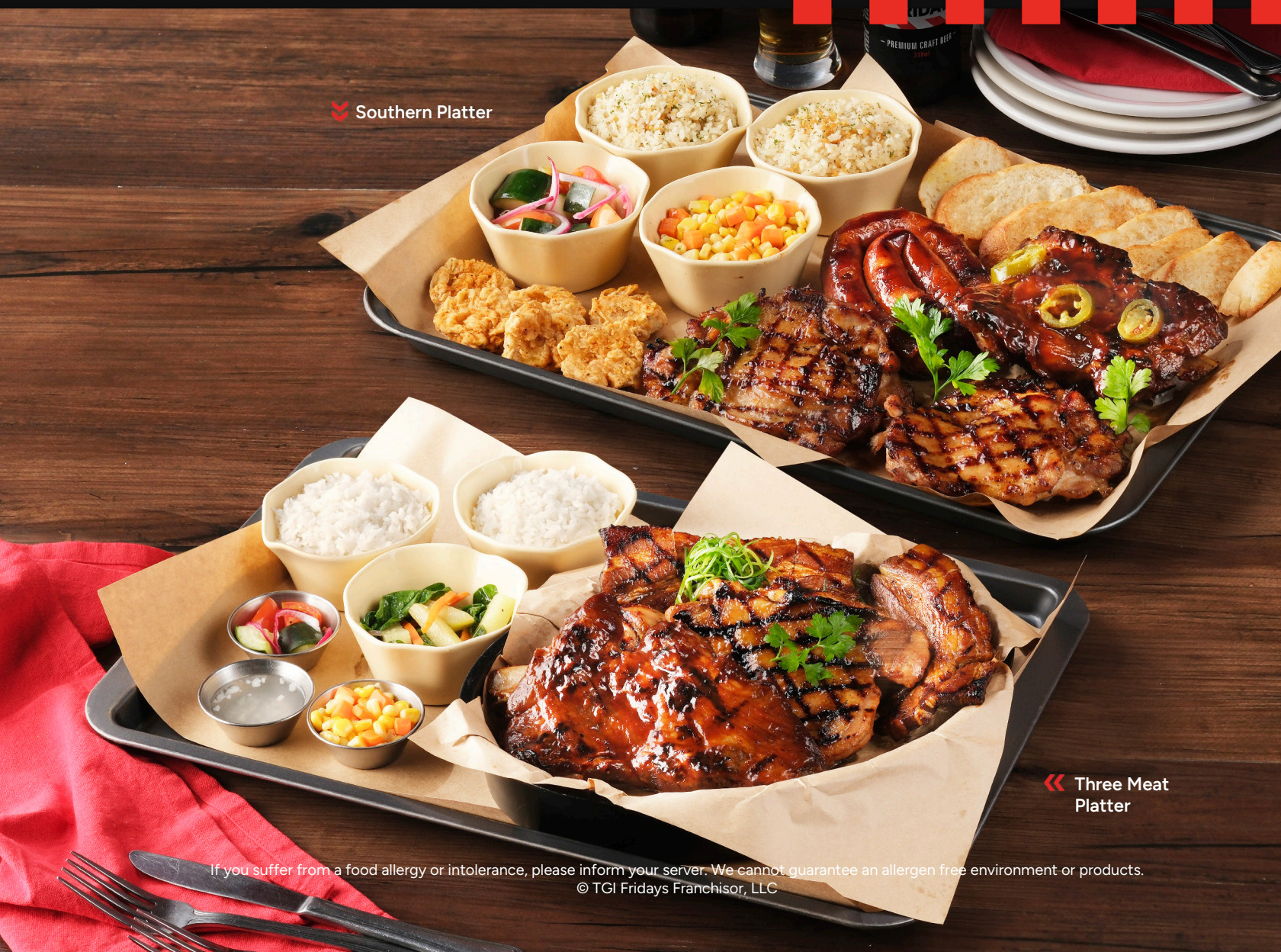
✓ Southern Platter

Fridays™ Signature Whiskey Glazed Riblets, Grilled BBQ Chicken, grilled andouille, two garlic rice, ensalada, corn and carrots, smashed potatoes, grilled baguette