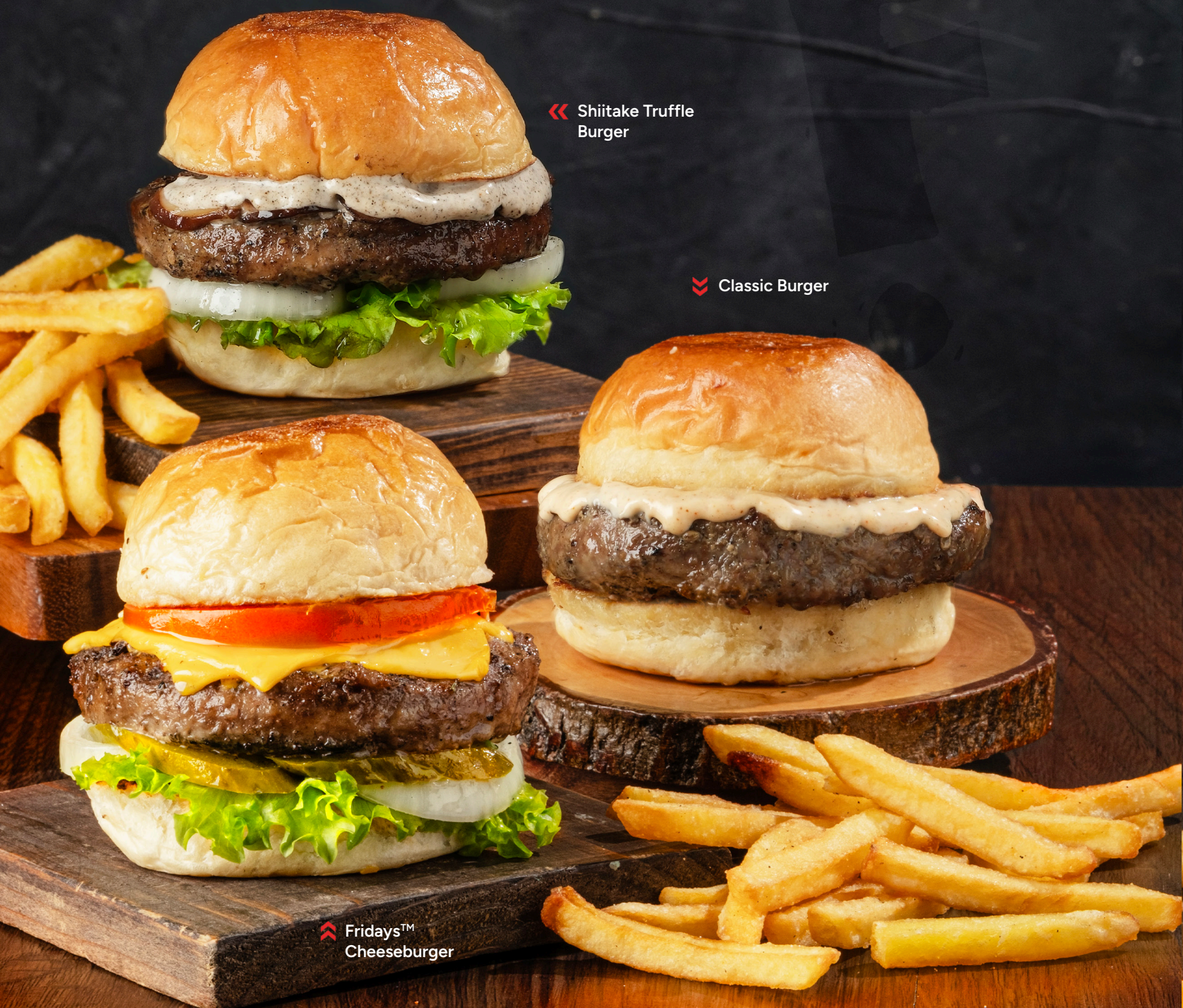
« Shiitake Truffle Burger