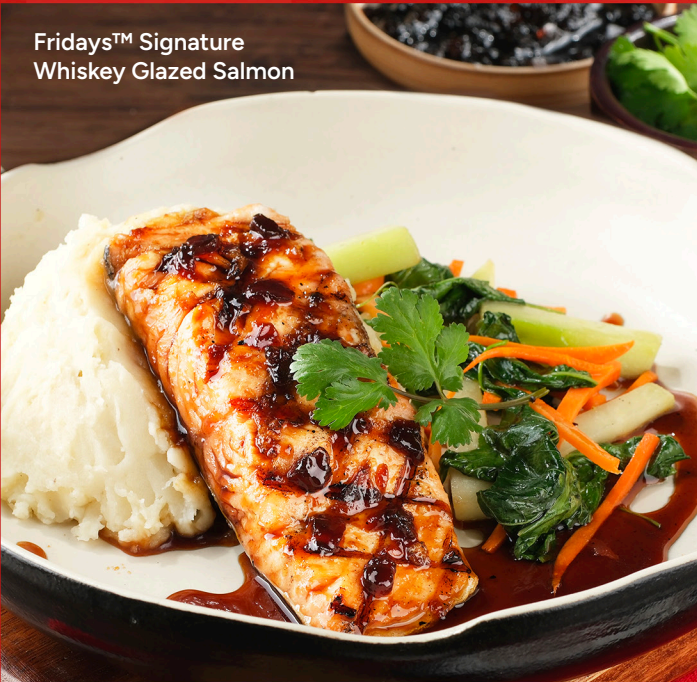
Fridays™ Signature Whiskey Glazed Salmon