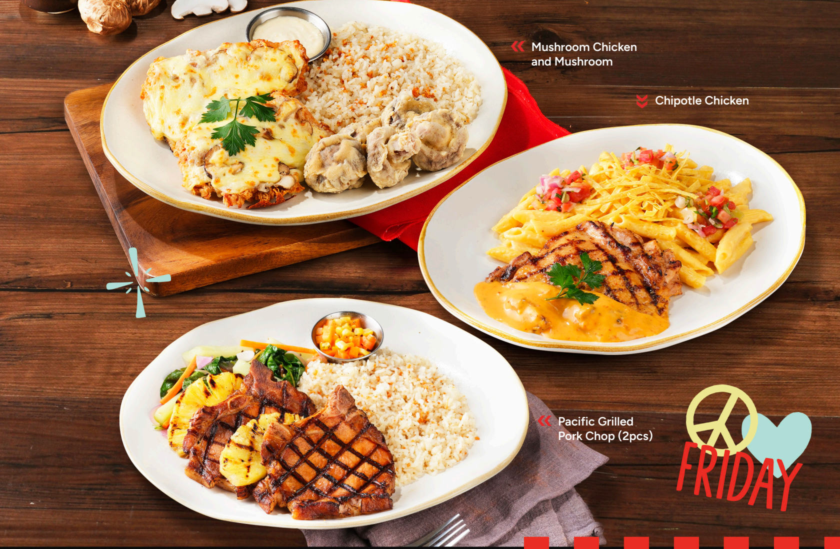
« Mushroom Chicken and Mushroom