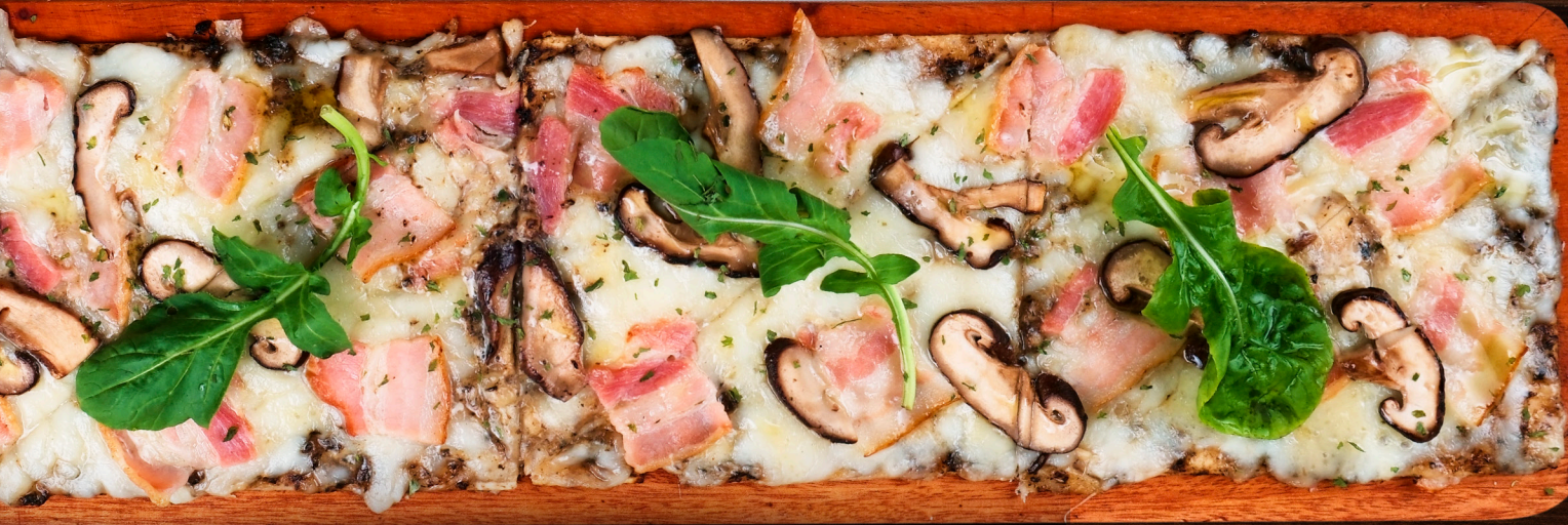
Truffle Bacon and Mushroom