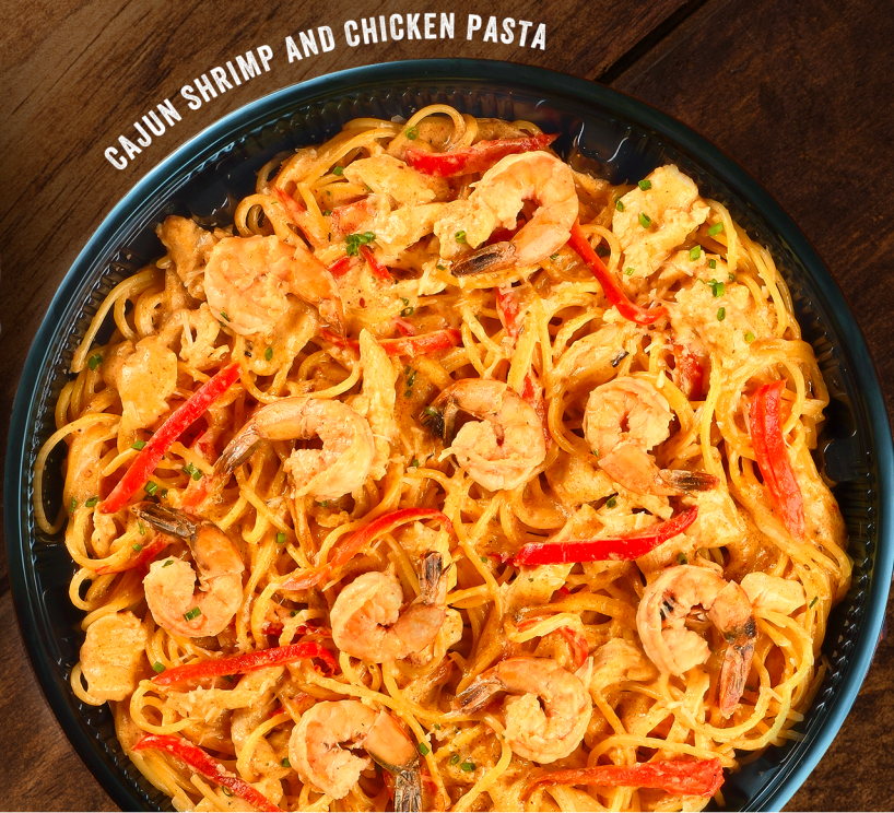
CAJUN SHRIMP AND CHICKEN PASTA