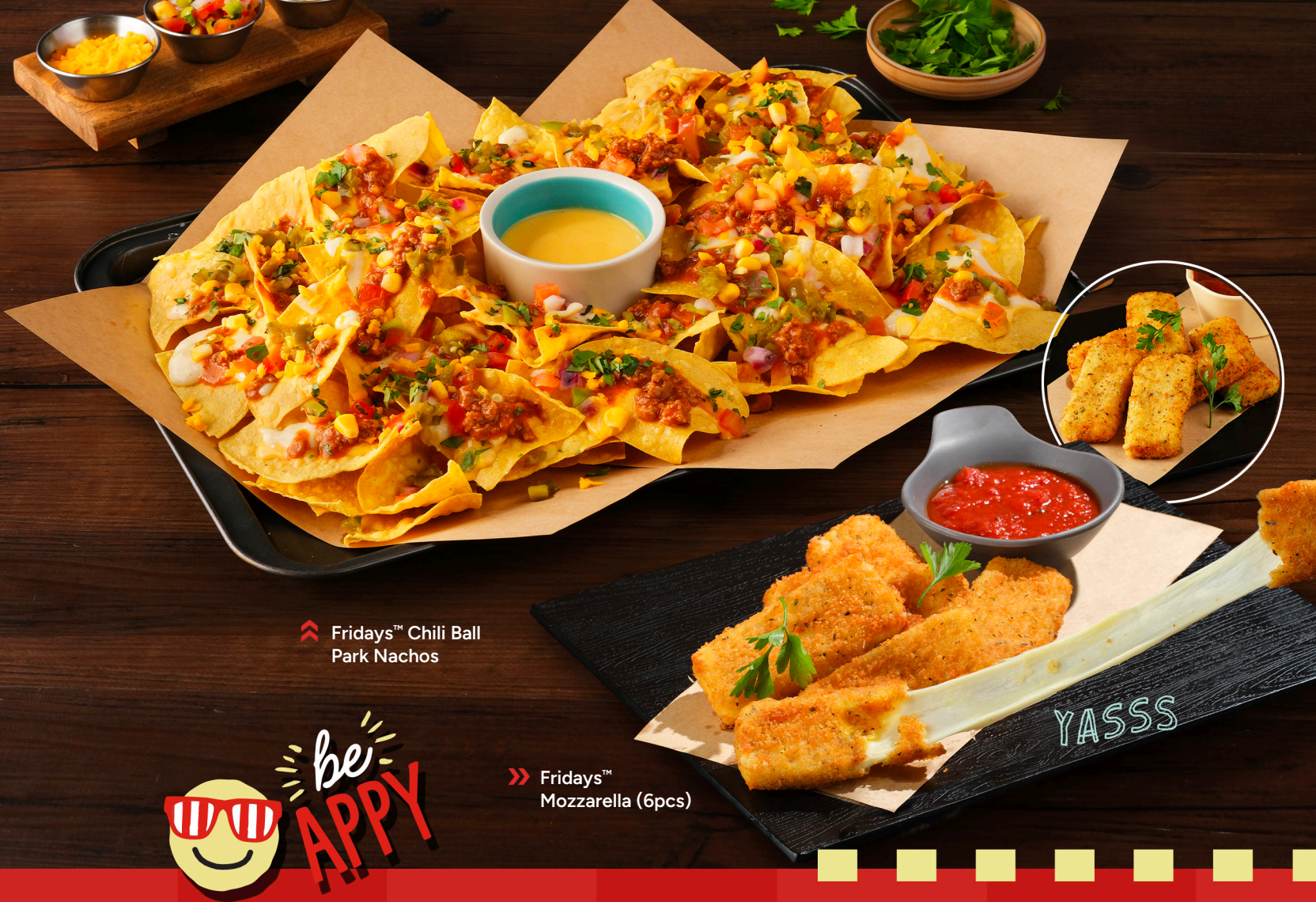
» Fridays™ Chili Ball Park Nachos