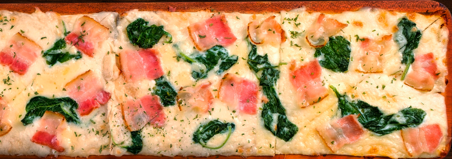
Bacon and Spinach