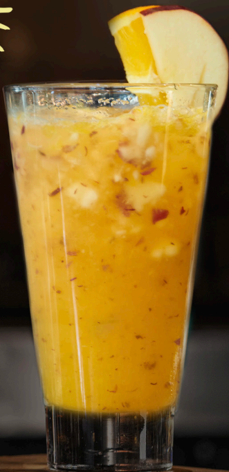
➤ Apple Orange