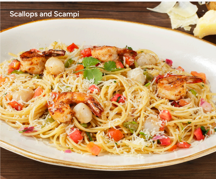
Scallops and Scampi