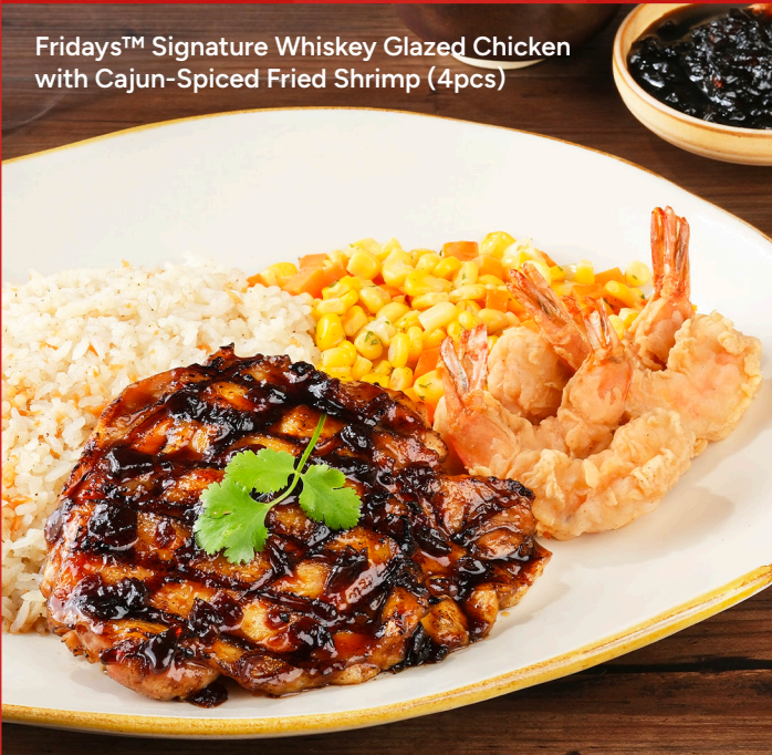
Fridays™ Signature Whiskey Glazed Chicken with Cajun-Spiced Fried Shrimp (4pcs)

Cajun-spiced fried shrimp (2pcs) 145 Cajun-spiced fried shrimp (4pcs) 275