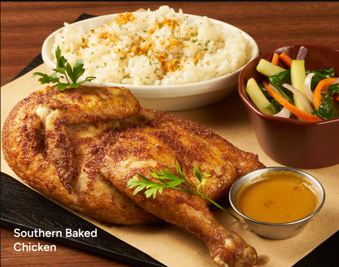
Southern Baked Chicken