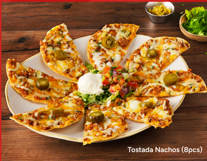
Tostada Nachos (8pcs)