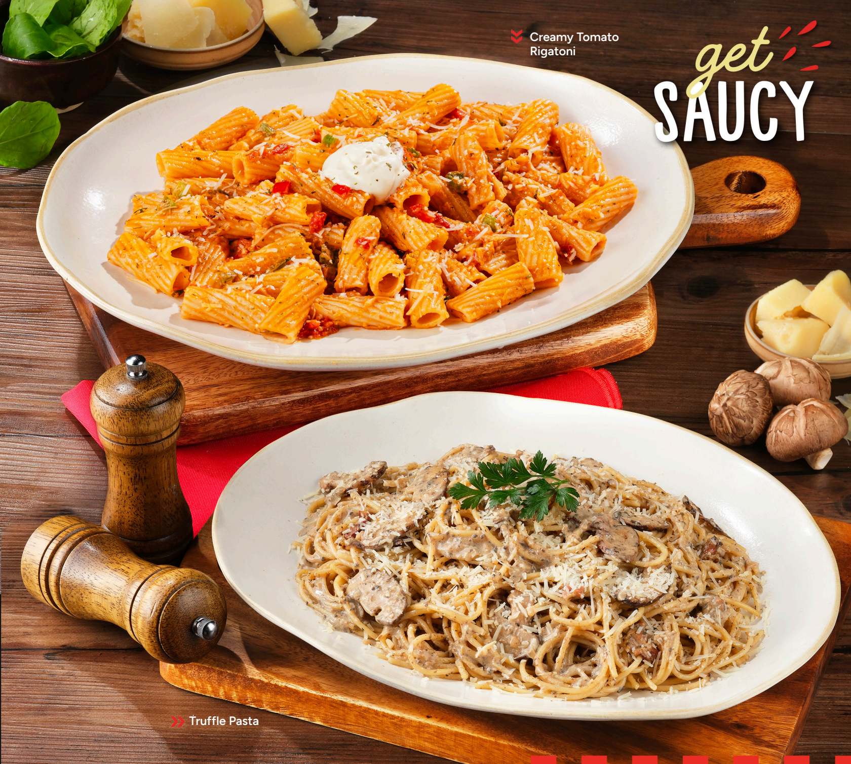
» Truffle Pasta