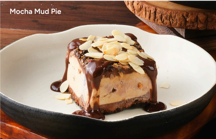
Mocha Mud Pie