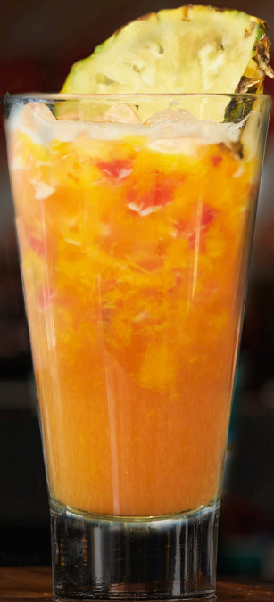
➤ Mango Tango