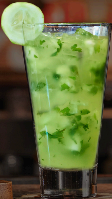
➤ Seafoam Splasher