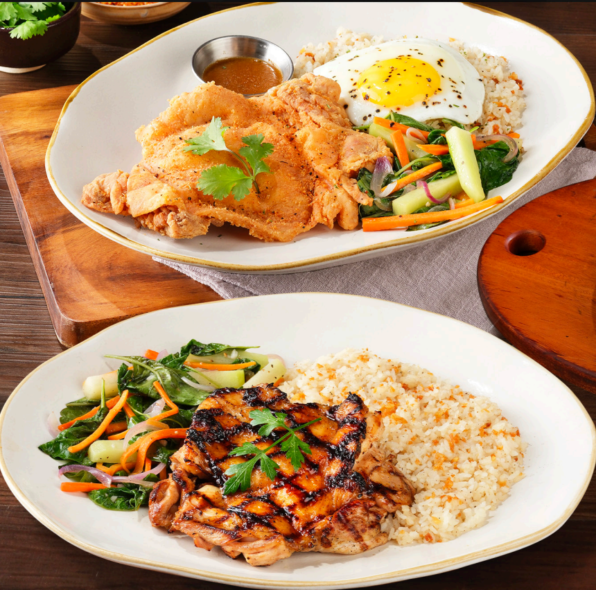
« 6 Spice Chicken