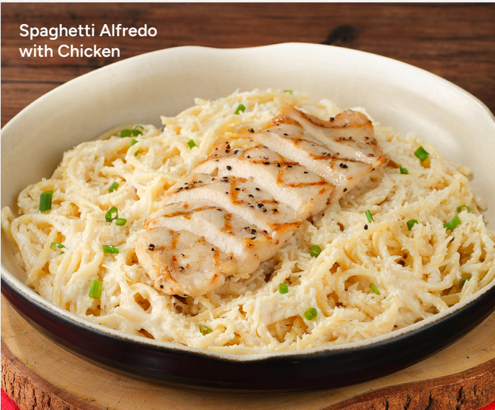
Spaghetti Alfredo with Chicken