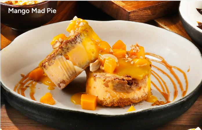
Mango Mad Pie

ARTISANAL ICE CREAM 120 Choice of vanilla, mango, coffee mocha or salted caramel