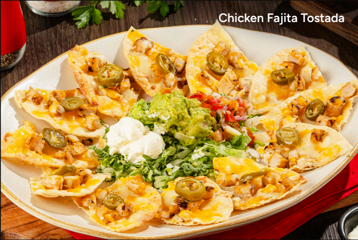
Chicken Fajita Tostada