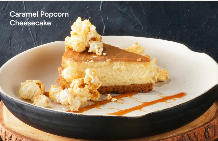
Caramel Popcorn Cheesecake