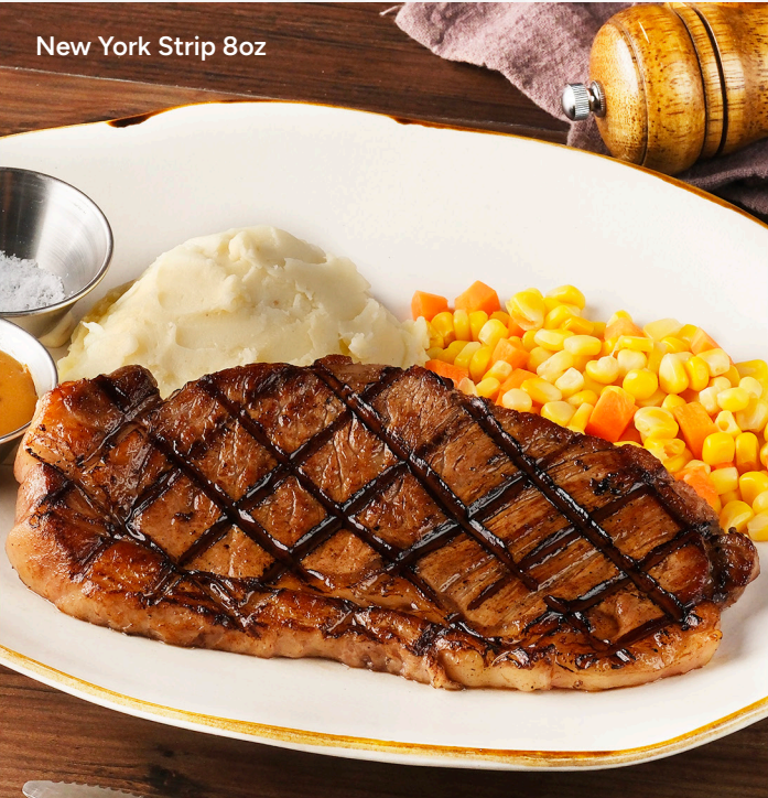
New York Strip 8oz