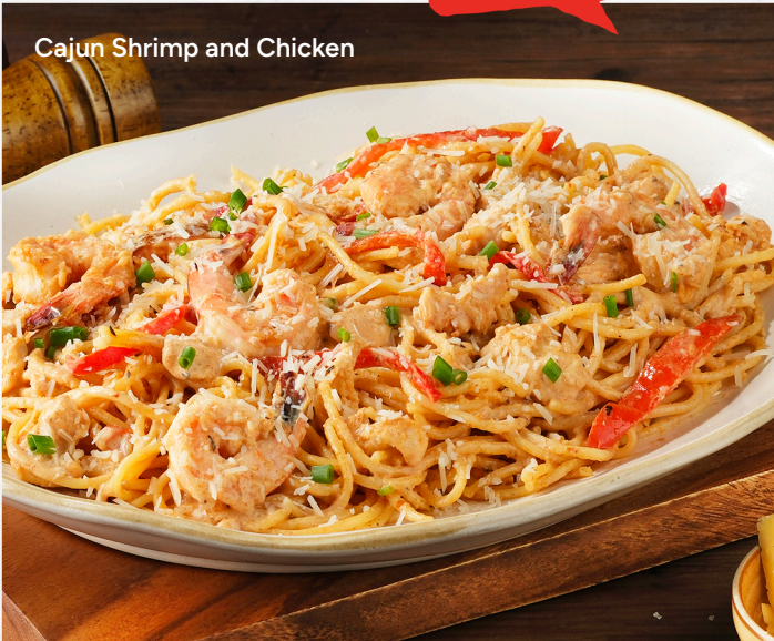
Cajun Shrimp and Chicken