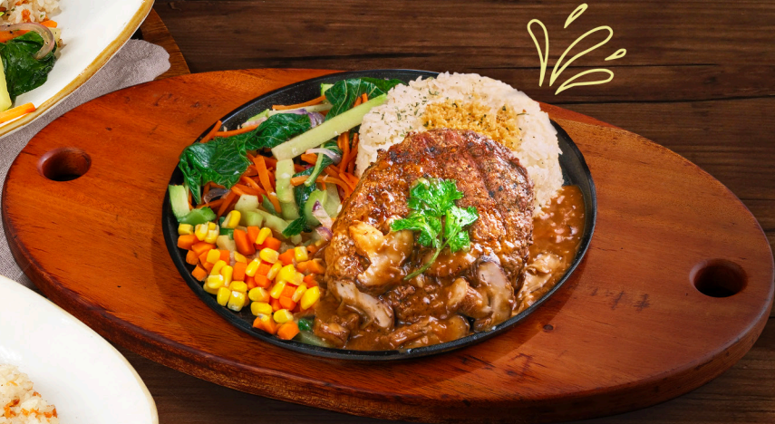
« Salisbury Steak