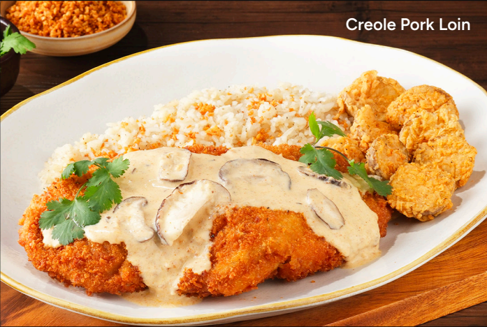
Creole Pork Loin

Tostada, chicken bites, mozzarella, colby cheese, jalapeño, ranch dressing, shredded lettuce, pico de gallo, guacamole, sour cream