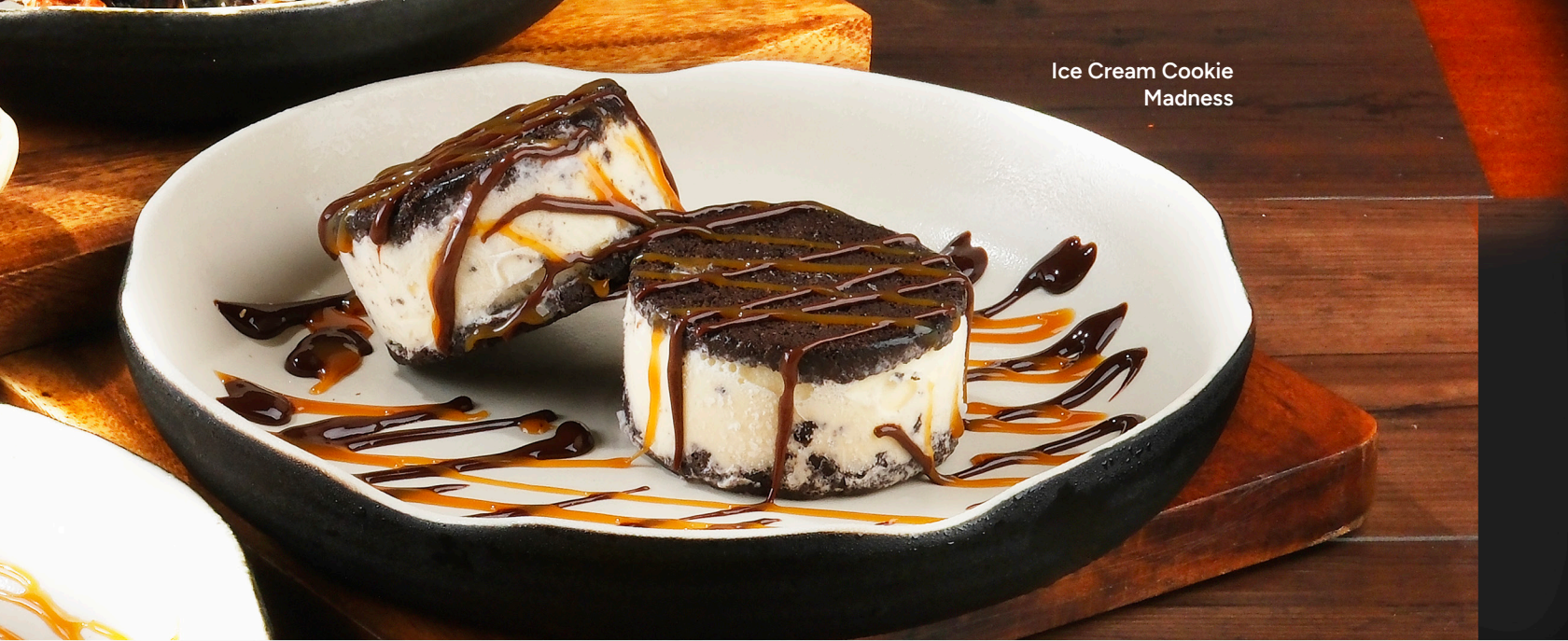
Ice Cream Cookie Madness