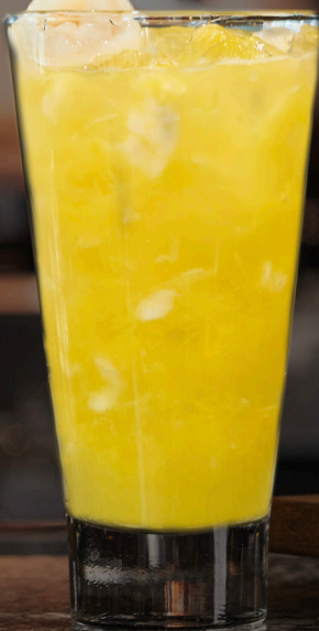
➤ Mango Delightchee