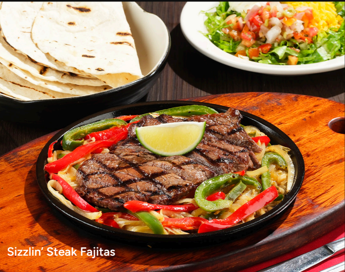
Sizzlin' Steak Fajitas

4 BONES choose 1 side 795 8 BONES choose 2 sides 1450 12 BONES choose 3 sides 2050